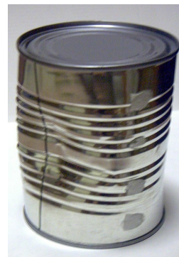
Dent on Seam