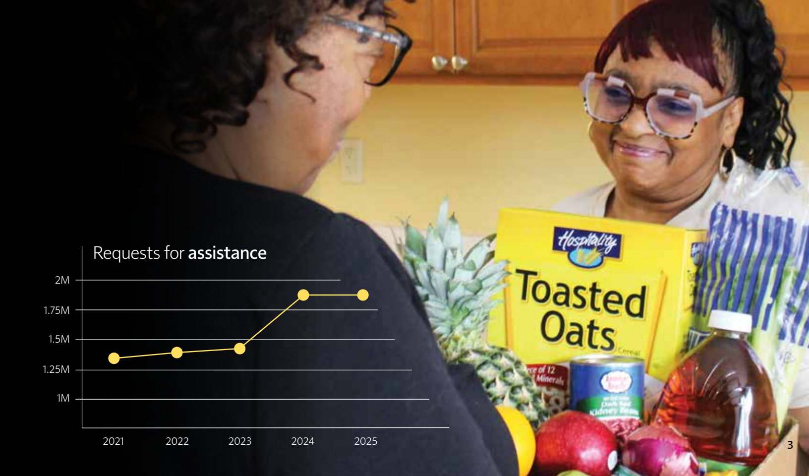
Requests for assistance